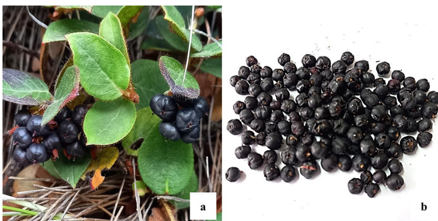
Figure 1. a) Gaultheria fruit glomerata (Cav.) Sleumer “laqa-laqa” on your plant. b) Fruit collected from “laqa-laqa”.

The sensory evaluation was carried out with 30 semi-trained panelists, determining the attributes of color, smell, flavor, general appearance and texture; using the hedonic scale from 1 to 5, with 1 being the lowest score and 5 the highest score.