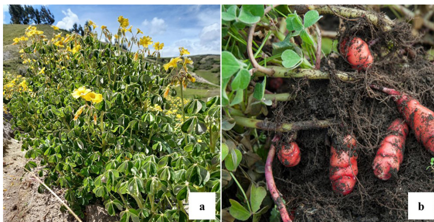
Figure 2. a) Plant of Oxalis tuberosa Mol. b) Stem of Oxalis tuberosa Mol. after the harvest.